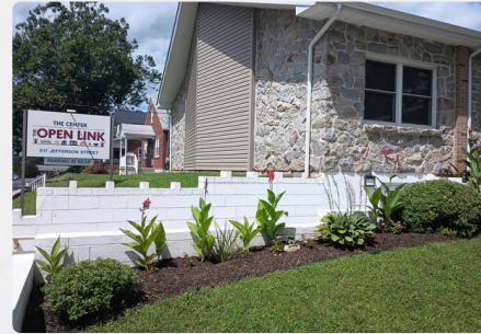
517 Jefferson Street East Greenville, 18041

Promotes healthy lifestyles, socialization, and volunteerism through programming focused on nutrition, education, and enrichment.