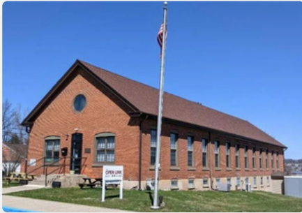
452 Penn Street Pennsburg, 18073

Provides services to individuals and families in need of financial, education, food, job assistance, and other resources.